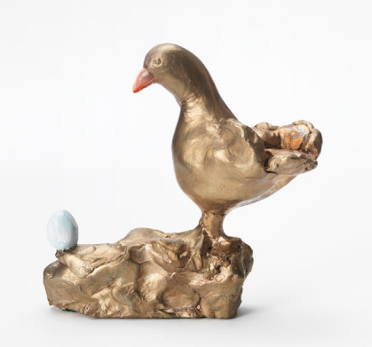
URS FISCHER mines the potential of materials—from clay, steel, and paint to bread, dirt, and produce—to create works that disorient and bewilder. Through scale distortions, illusion, and the juxtaposition of common objects, his sculptures, paintings, photographs, and large-scale installations explore themes of perception and representation while maintaining a witty irreverence and mordant humor. <sup>2</sup>