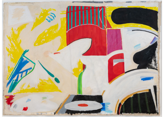
Lady Ponders Painting Music and Food, 2020

In these musings on the classical motif, Sweeney distills the figure down to its essence, conveyed through shape, hue, and line. Monochromatic paintings such as Before Behind (2019) and Moonlit Lady (2012) create a bold feminine figure in outline and emphasize a lyrical playfulness. Improvisations such as Woman with Metronome (2019) is an exploration in the boundaries of abstraction and form.