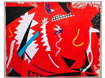
Woman with Metronome, 2019